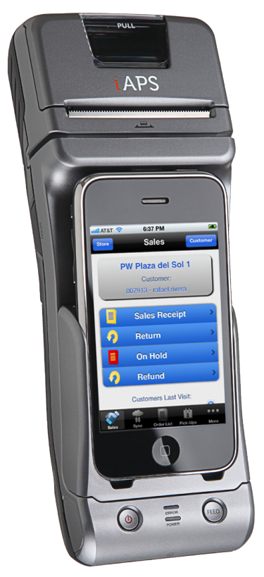
The iAPS sled adds scanning, secure card swiping, and receipt printing to the iPhone.

The iPhone-based solution only costs a fraction of a traditional POS system, and it is easier to deploy. There are no cables and no equipment to install. The eMobilePOS software is distributed via iTunes along with any software updates.